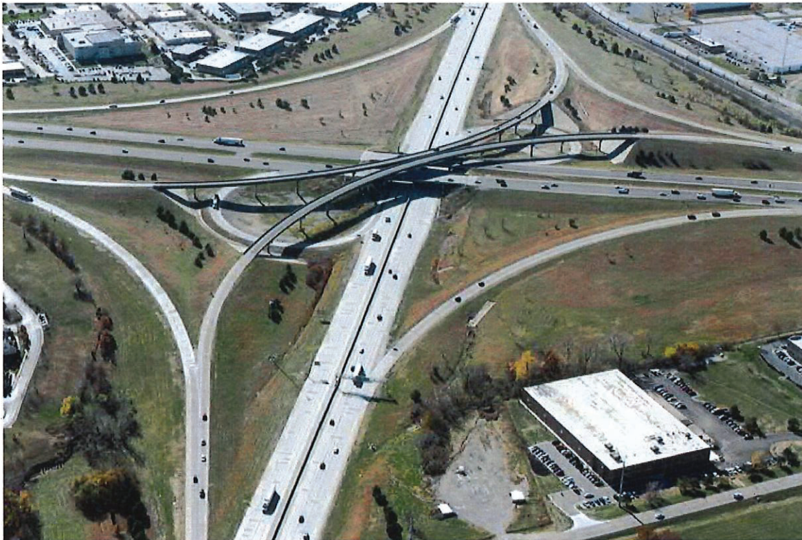
Johnson County Gateway Project – I-435 • I-35 • K-10