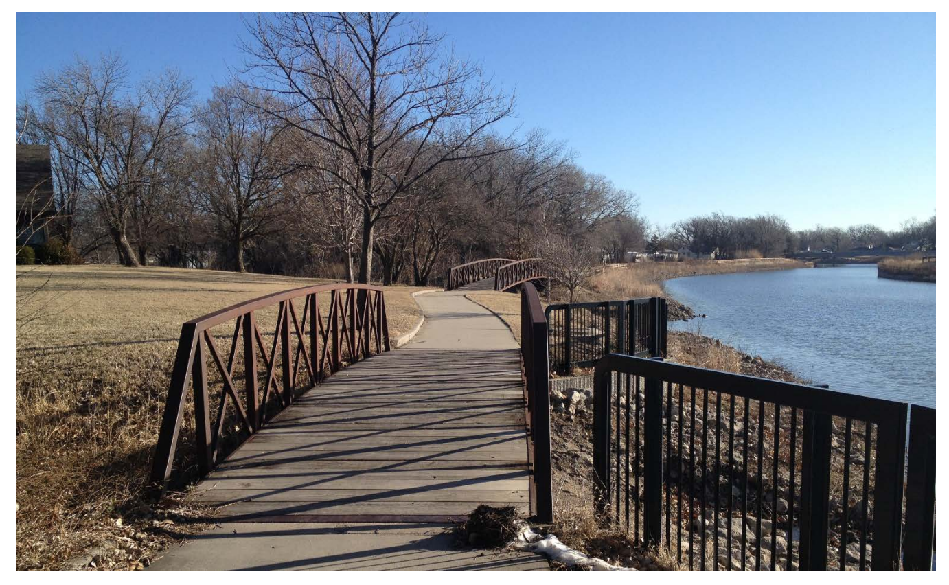
Figure 2: Sand Creek Trail in Newton, KS