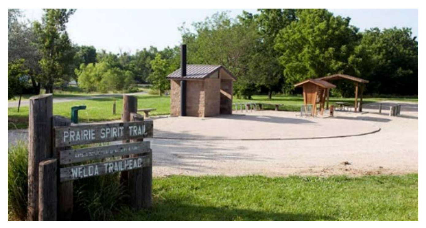
Figure 1: Prairie Spirit Trail State Park (Image Source: KDWP)