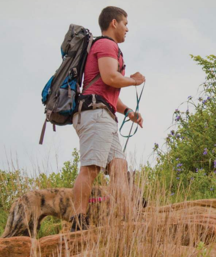
Gypsum Hills Scenic Byway, Medicine Lodge, F-6