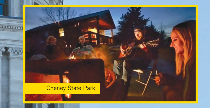
Cheney State Park