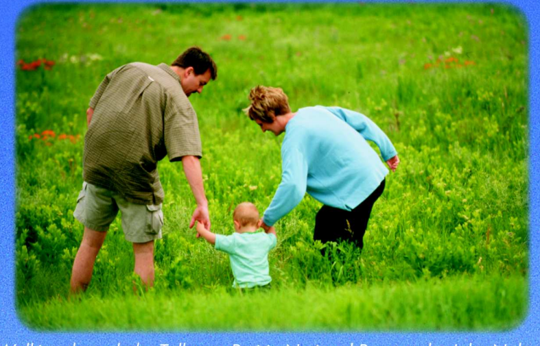
Walking through the Tallgrass Prairie National Preserve

Reference icons on map for location of Recreation Areas. This is not a comprehensive list. The Kansas Department of Wildlife & Parks and the U.S. Corps of Engineers often both maintain recreation areas at the same lakes in Kansas. Separate permits and regulations may apply to those areas.