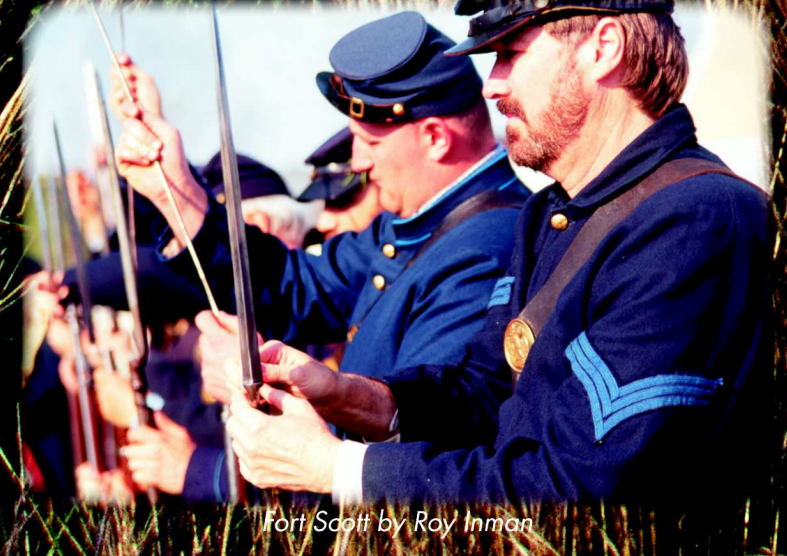
Fort Scott by Ray Inman

The foods, festivals and names of Kansas reflect the many peoples who have made the state their home. European immigrant, Native American, African American, and Hispanic influences still blossom from deep historical roots. Within a days drive, you can find Italian, Czech, German, Mennonite, Mexican, and barbecue flavors. Of course, a wide array of beef samplings are available anywhere in this, the nation's second leading beef-producing state. Agriculture defines the landscape and culture of much of Kansas, and the bounty of our fields are as likely to turn up on fine dining tables as in fine art galleries around Kansas. For many, Kansas is Americana – county fairs, minor league baseball, soda fountains, open vistas, and a pace of life that leaves plenty of room and time for big dreams.