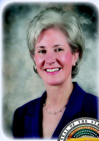
Kathleen Sebelius Governor