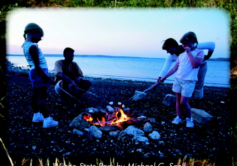
Wilson State Park by Michael C. Stahl

The foods, festivals and names of Kansas reflect the many peoples who have made the state their home. European immigrant, Native American, African American, and Hispanic influences still blossom from deep historical roots. Within a days drive, you can find Italian, Czech, German, Mennonite, Mexican, and barbecue flavors. Of course, a wide array of beef samplings are available anywhere in this, the nation's second leading beef-producing state. Agriculture defines the landscape and culture of much of Kansas, and the bounty of our fields are as likely to turn up on fine dining tables as in fine art galleries around Kansas. For many, Kansas is Americana – county fairs, minor league baseball, soda fountains, open vistas, and a pace of life that leaves plenty of room and time for big dreams.