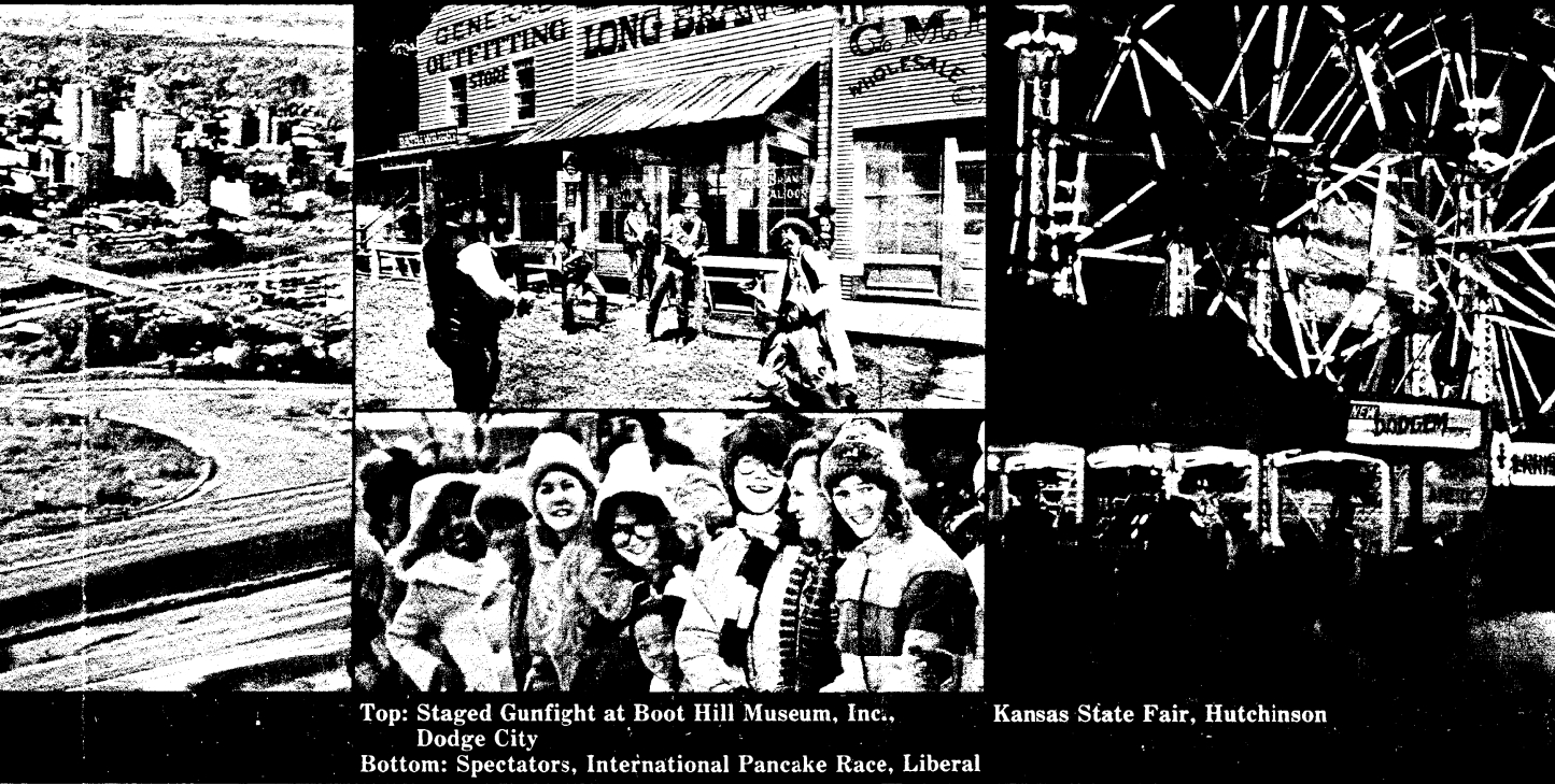
Top: Staged Gunfight at Booth Hill Museum, Inc., Dodge City Bottom: Spectators, International Pancake Race, Liberal

Wind your way through miles of American history, right here in Kansas. Relive the past in the historic pioneer towns and forts. Discover the geological wonders, tranquil lakes and streams, scenic trails, and hundreds of museums. Celebrate life at the warmhearted fairs and colorful festivals. Come alive in Kansas.