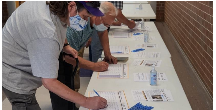
Community members shared their contact information with the project team during the 2021 public meeting