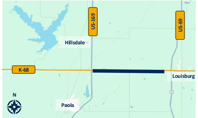
Map of the K-68 expansion area

The latest project information will be made available on the project webpage: ike.ksdot.gov/miami-county-k-68-expansion