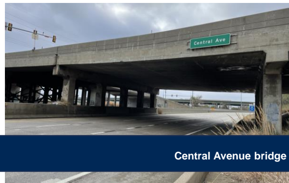
Central Avenue bridge over I-70