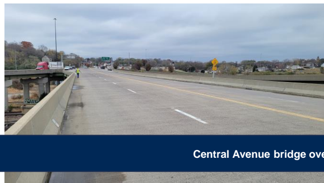
Central Avenue bridge over I-70

Future meetings are planned for the project. The project website will update as the project progresses. You can check for project updates and submit comments at the webpage at https://ike.ksdot.gov/central-avenue-bridge .