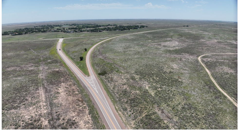
U.S. 83 Business Southwind Junction