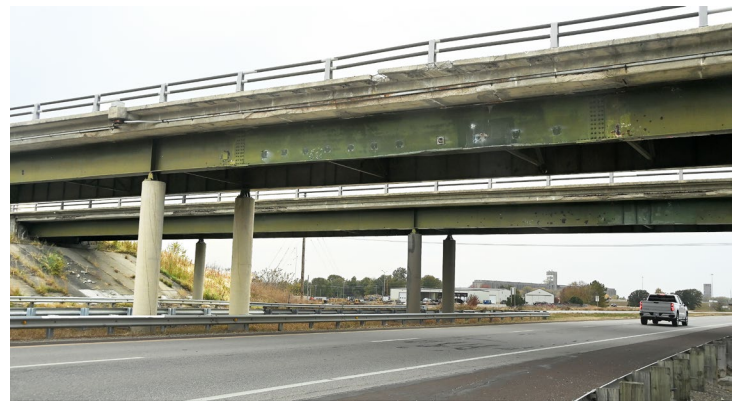
The Stover Road Bridges over U.S. 24